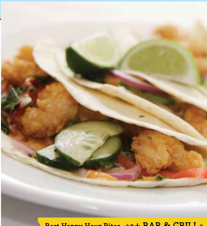
Best Happy Hour Bites → a+ BAR & GRILL ←

If you want something more imaginative than your everyday happy hour chips and dip, head to the Alden Hotel's a+ BAR & GRILLE for $2 shrimp tacos and crispy calamari, both sure to make you a seafood lover. MCCORMICK & SCHMICK'S has fried shrimp, an ahi tuna roll or ceviche and none of it's over $4.95. With 59 beers, specials on the three wisemen, martinis and perfect brick oven pizzas, ANGELO'S is a primo happy hour destination – seven days a week. For great food with a stunning view, you want THE TREEHOUSE in Discovery Green. Beef sliders, Kona kampachi and Kennebec potato chips all make an appearance on an extensive menu, as do several signature cocktails.